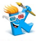
Kid Pix Deluxe 3D

3rd Grade: Students have been working on a rock/mineral Kid Pix slideshow. Students began by selecting a topic and researching the answers to five questions. Research is a tough skill; students persevered during this step. Then students used a storyboard paper to plan out their slides for their slideshow. Included in this step was a discussion on naming your computer files? How do you select a good name? This an important step in staying organized. Then we moved on to creation. Lots of work ahead but I can already see their writing experience from Google Docs and their Kid Pix experience coming together quickly.