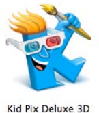
Kid Pix Deluxe 3D

2nd Grade: Students are creating a Kid Pix slideshow sharing their classroom continent research. Students have explored slideshows made by previous second graders and are now working on creating their pages. Slideshows will consist of a cover page, three different topic pages and a closing page. All pages will consist of a background (either drawn or ready made), typed facts and picture details. I'm already very impressed with their focus and drawing skills! I love what I am seeing!