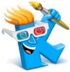
Kid Pix Deluxe 3D

1st Grade: Students are learning to use Kid Pix 3D. Each week we explore several tools. Thus far, they have explored: pencil, paintbrush, bucket, mixer, rubber stamper, oops guy and the water pump. Kid Pix 3D is always a first grade favorite.